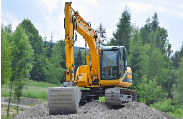
Heavy Equipment Operator